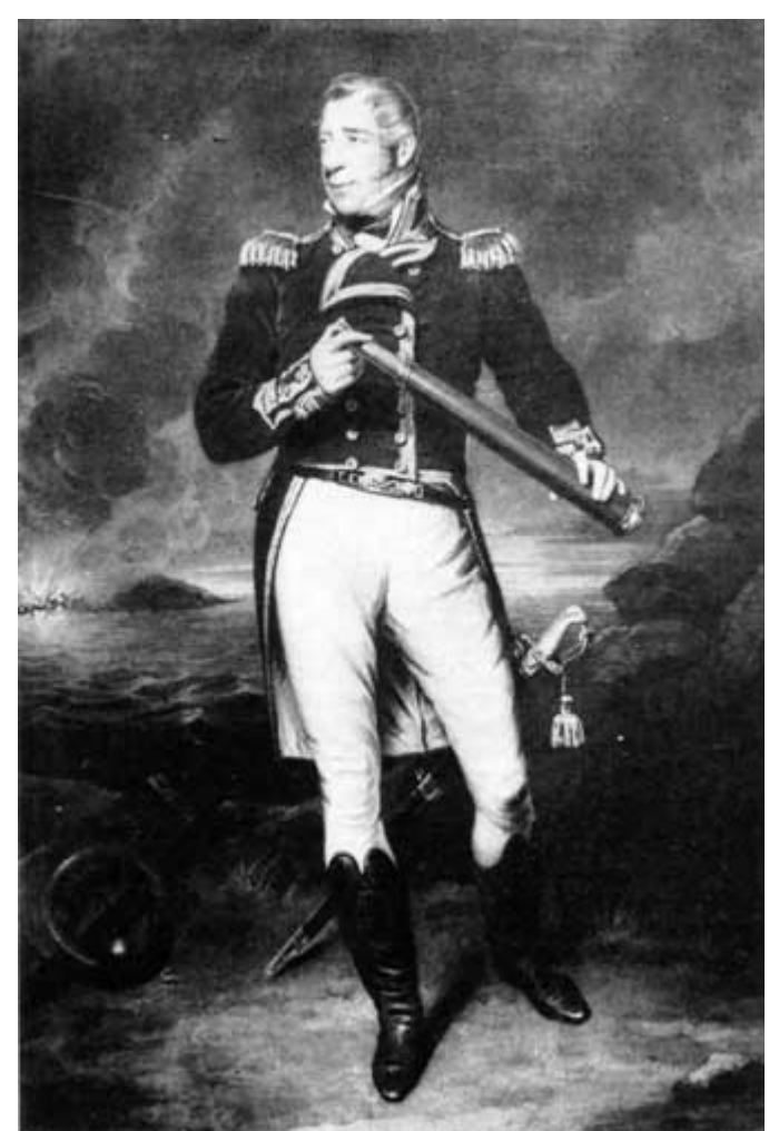
Lord Cochrane, First Admiral of Brazil (From the mezzotint by Meyer showing him in his prime in 1810)

of captured seamen changing sides rather than face unpaid imprisonment. A minor revolution in 1831 and the abdication of Emperor Pedro brought a government to power in Brazil which believed in economies and retrenchment. The navy which was cut to one-fifth of its former size and was firmly recast in the role it was to play for the rest of the century, that of regional policeman and coastguard. When it eventually went to war, first against the Argentine dictator Juan Manuel de Rosas in 1852, and then against Paraguay as part of the Triple Alliance with Argentina and Uruguay in 1865, its field of glory lay not on the ocean but in seizing control of the great internal rivers of South America.