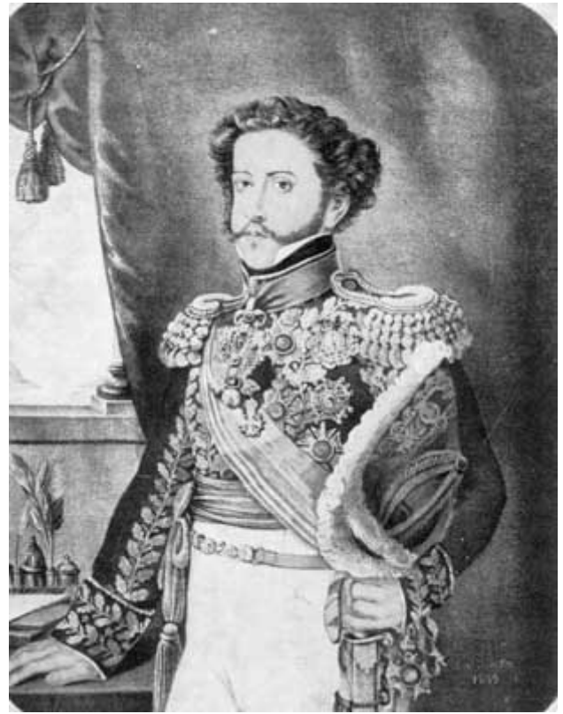
The Emperor Pedro I of Brazil

Recruitment in London and Liverpool presented few problems. There were a sufficient number of hardy souls willing to exchange the chilling fogs of the European winter for service in the sun, good pay and prize money. The salary scales of the Brazilian Navy may have been generous for seamen, but for officers they were less so. £8 a month for lieutenants and £5 for sub-lieutenants were only two-thirds of the rates paid in the Royal Navy, but the comparison meant little to men who had long since abandoned all hope of ever serving again under the British flag. Furthermore, the contracts offered by the Brazilian Agent were attractive. Each officer was to sign on for five years - if at the end of that time he remained in the service he would receive an extra 50 per cent in addition to his normal salary; if he returned to Britain he would receive Brazilian half-pay for the rest of his life. Free passages were provided and pay was to commence from the date of embarkation. [4] All the officers recruited by Thompson had previ-