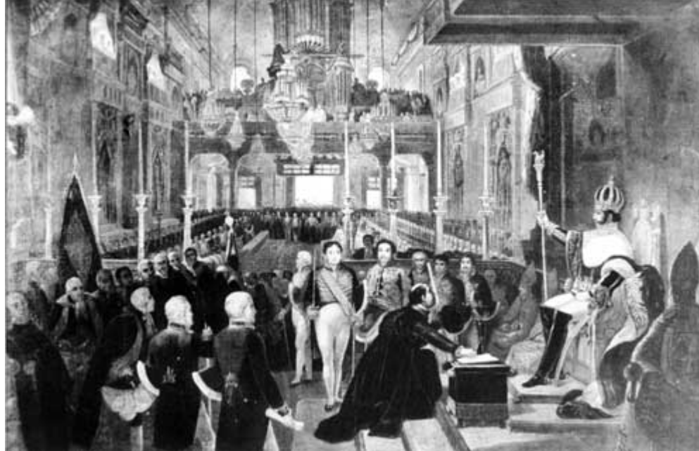
The Coronation of Pedro I in 1822 (J.B. Debrett)

left the service; and Lieutenants Chester, Challes and Mosselyn had died or become invalids, a relatively small proportion in view of the diseases prevalent on overcrowded ships in the tropics.