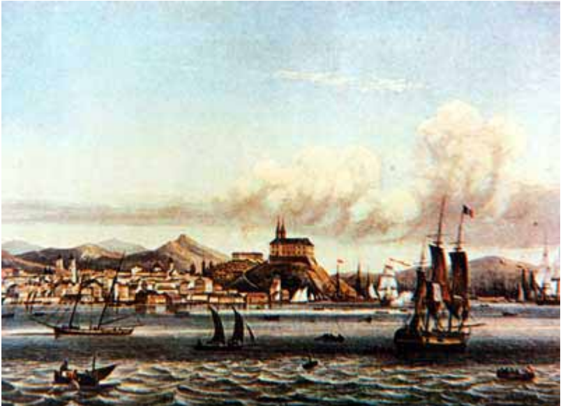
View of Rio de Janeiro 1799 (Garneray)

In the literal sense they were mercenaries, but that word acquired distasteful associations in the twentieth century and is best avoided. These men simply sought to earn a living. Since the Revolutionary and Napoleonic Wars had lasted for a generation, there were plenty of people in Europe who knew of no other occupation or had no other expectations.